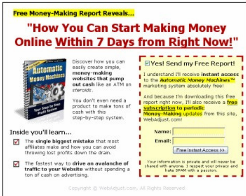
Image: Example Squeeze Page